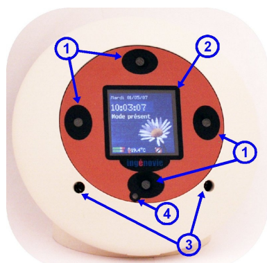
Integrated sensors and interfaces

It is for this purpose that the room-manager Wally is equipped with sensors, interfaces and intelligence necessary to accomplish his mission.